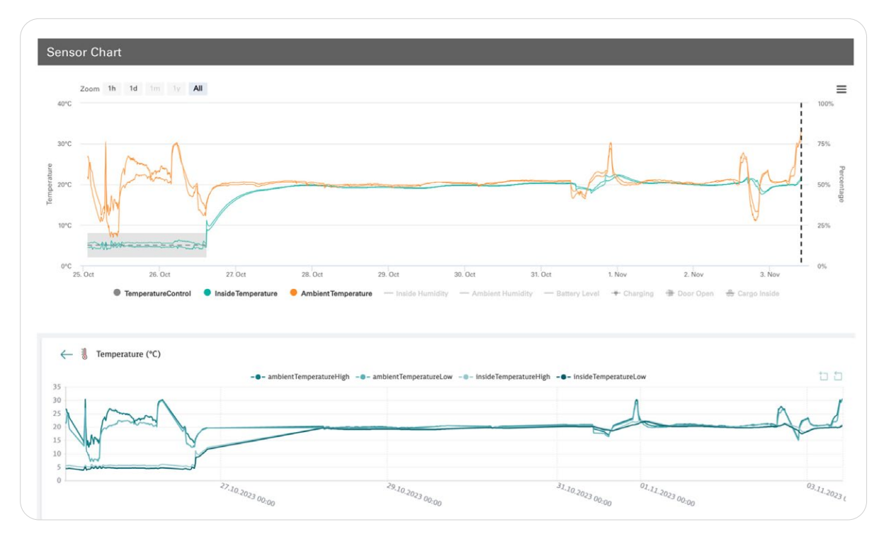
Comparison of temperature data from a live shipment in the Envirotainer Portal (top) and DB Schenker's IoT system (bottom)

This successful integration is a testament to DB Schenker's dedication to excellence in logistics and their commitment to find innovative ways to add value for their customers to ensure the safe and efficient transport of temperature-sensitive biopharmaceuticals.